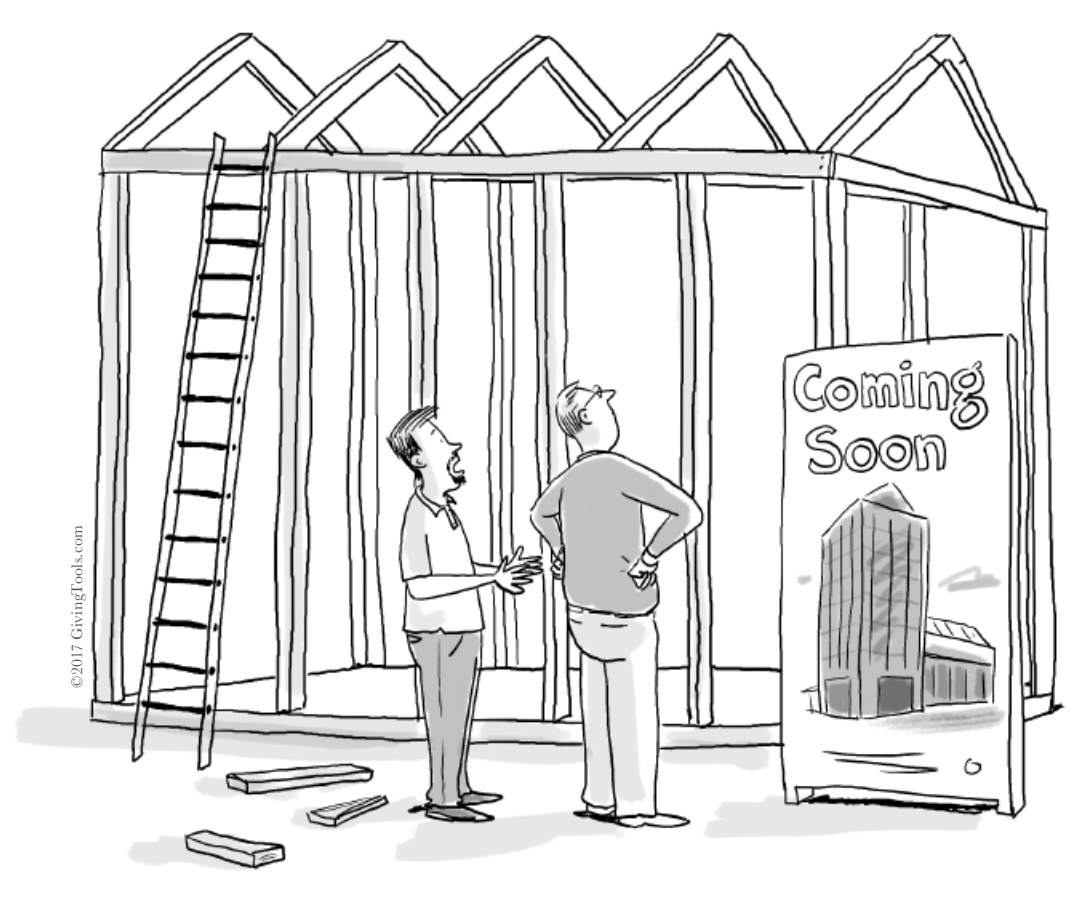
Yeah, pledge attrition kind of changed our plans.