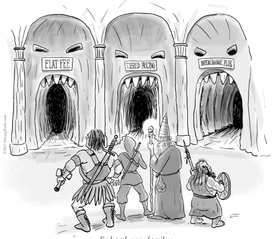
Each path seemed perilous.