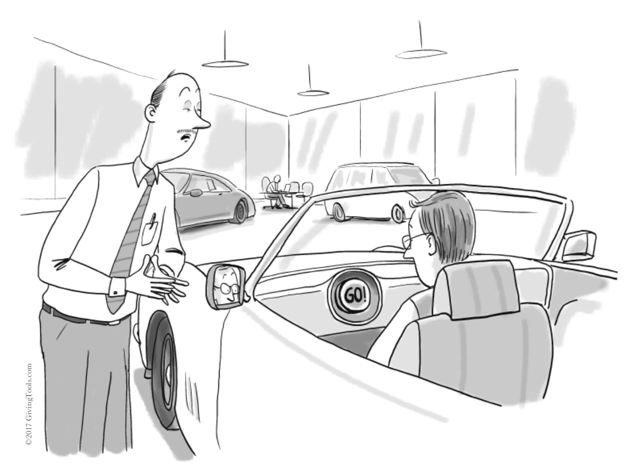
As you can see, the controls are both minimalistic and intuitive.