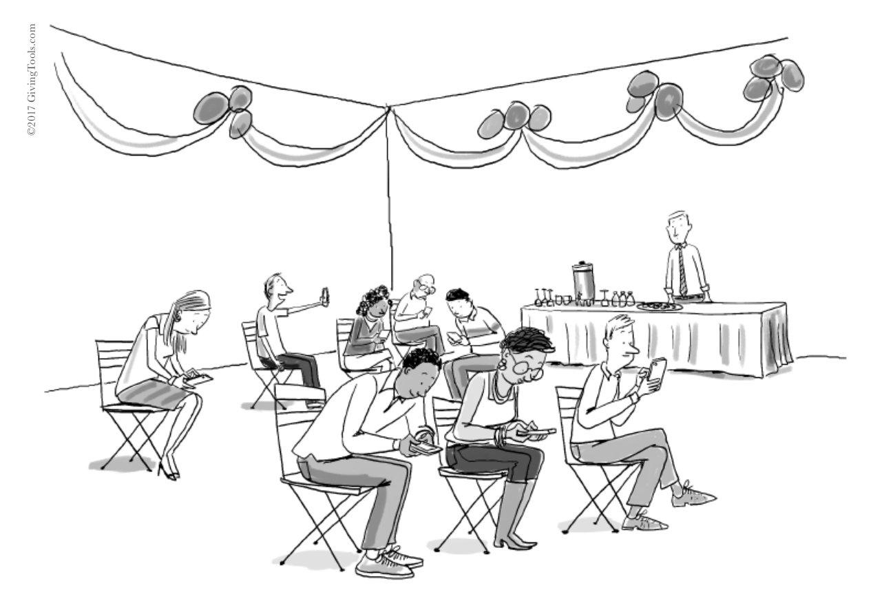
Suddenly Bob realized text-to-give might not have been the best choice.

Before we delve further into online giving, let's first step back and look at the bigger picture... to see online giving in the context of electronic giving more generally and to home in on the particular kind of online giving we'll be covering in this guide.