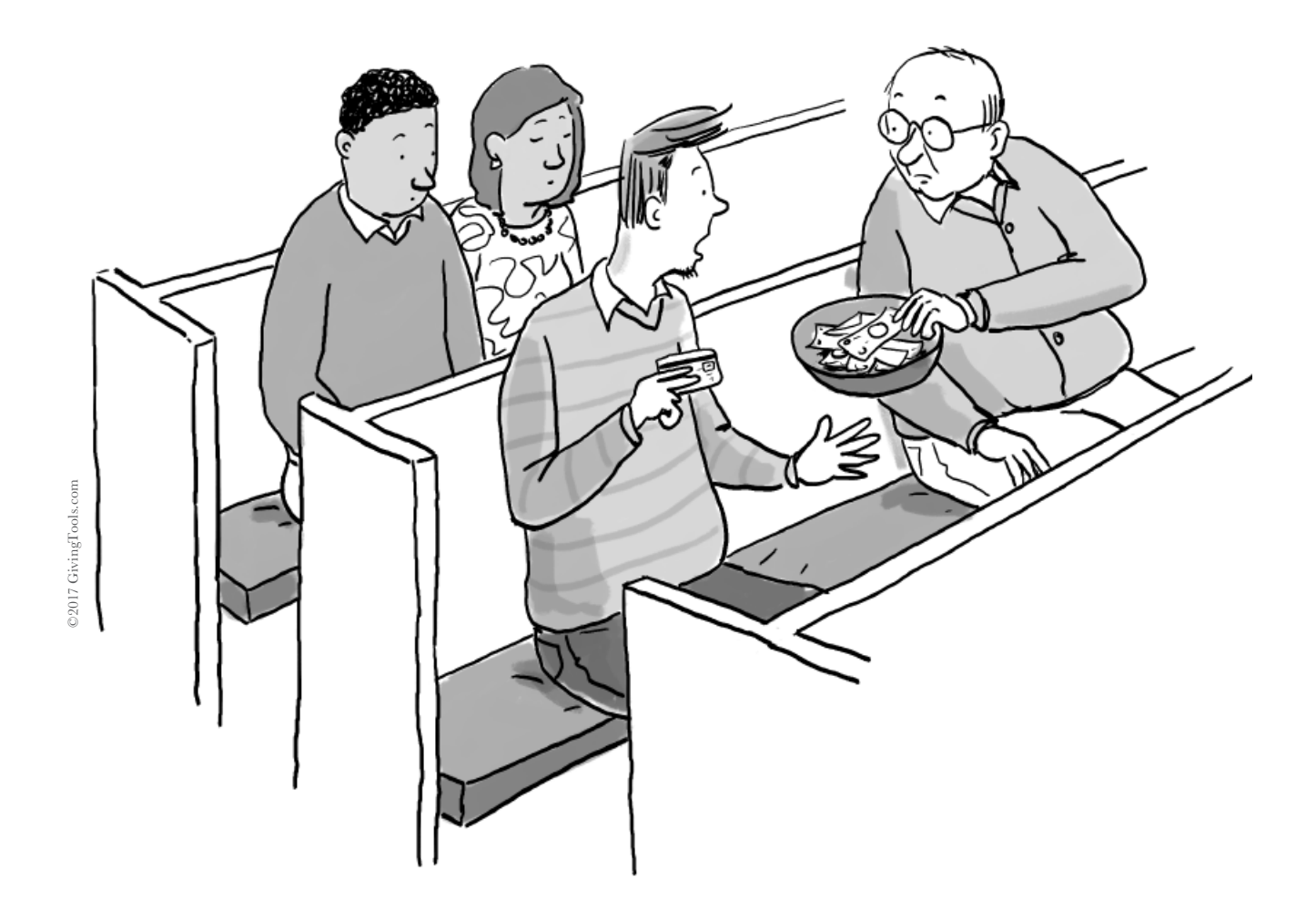
Excuse me, but is this thing chip-enabled or swipe only?